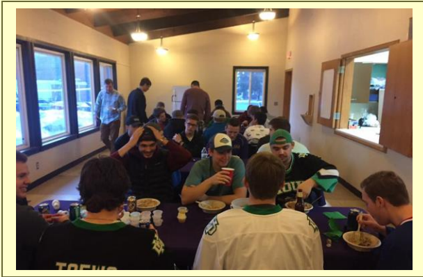
Hockey Watch Party Dinner