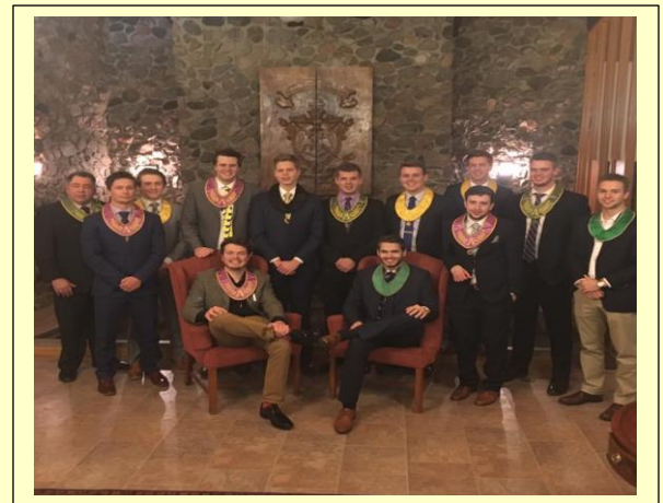
2017 Officer Installation

Brotherhood is like branches on a tree. We might grow in different directions, yet our roots remain as one.