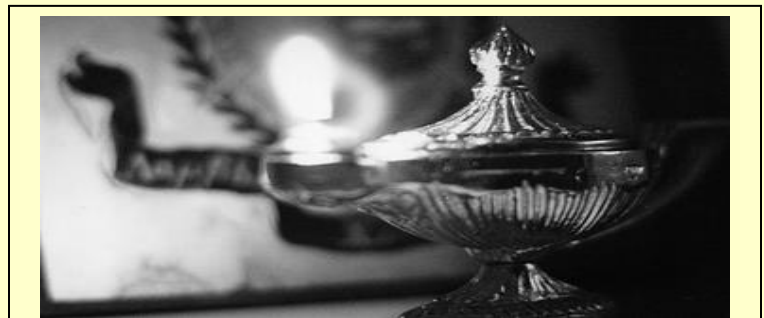
“Thousands of candles can be lighted from a single candle and the life of the candle will not be shortened. Happiness never decreases by being shared”. –Buddha