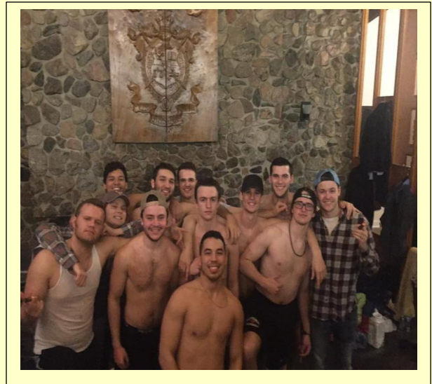
Spring 2017 Initiates